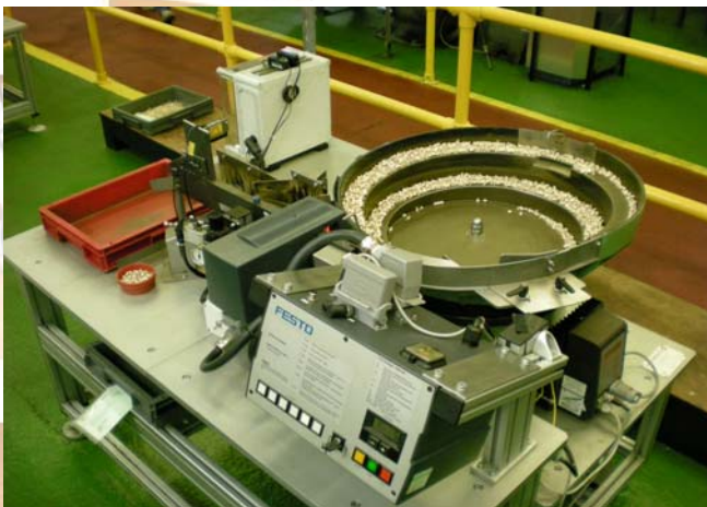
Automated Fastener Sorting Equipment