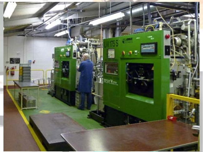
High Volume – Fastener Cleaning Machines