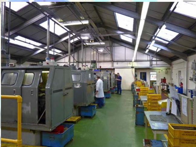
Auto M/c Shop